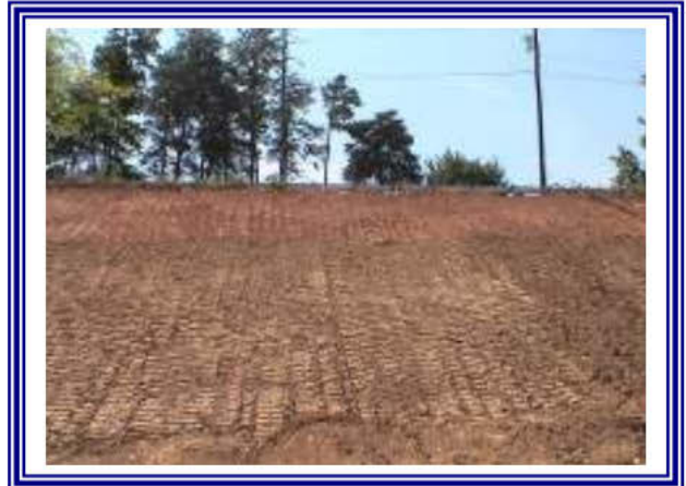
Surface Roughening (Tracking)