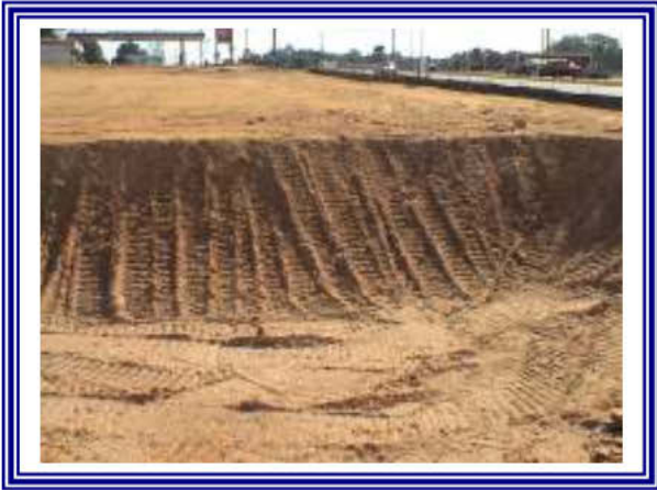
Surface Roughening (Tracking)