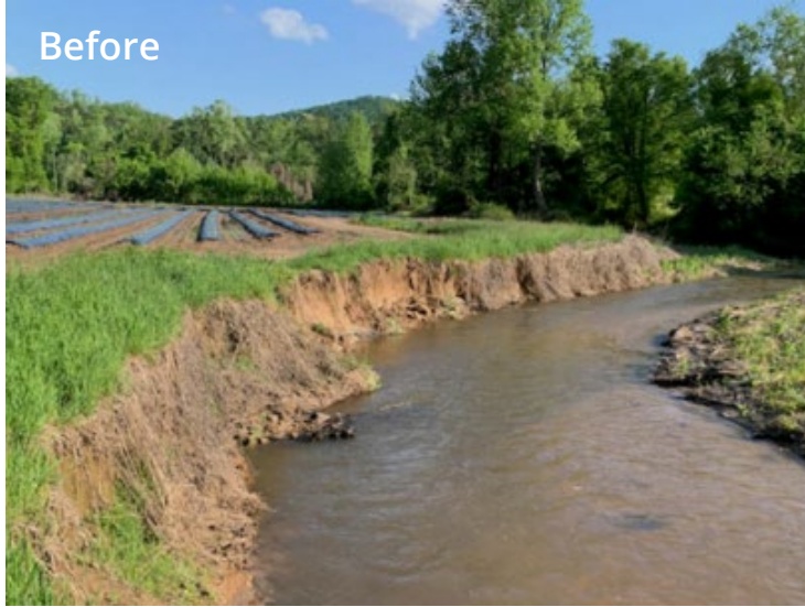
Streambank Restoration by Save Our Saluda