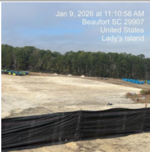
Photo Taken: 1/9/2026 4:10:00 PM GPS Latitude: 32.47131666666667 GPS Longitude: -80.64943611111111 GPS Altitude: 21.19 meters GPS Orientation: 1 degrees

Lower deck is fully covered, previous upper deck working face is also covered as of yesterday. Eastern slope grass has been slow to grow, facility plans to re-seed some areas. Odor was not detectable on Middle rd driving in to inspection, and was not as strong on site as last inspection. Facility also plans on acquiring tarp to cover turn-around areas of working face to limit odor.