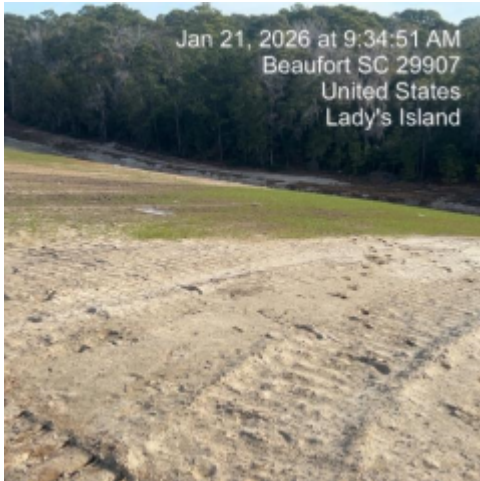
Photo Taken: 1/21/2026 2:34:00 PM GPS Latitude: 32.470797222222224 GPS Longitude: -80.64864444444446 GPS Altitude: 10.93 meters GPS Orientation: 1 degrees

Photo Taken: 1/21/2026 2:33:00 PM GPS Latitude: 32.470908333333334 GPS Longitude: -80.6493138888889 GPS Altitude: 19.25 meters GPS Orientation: 1 degrees