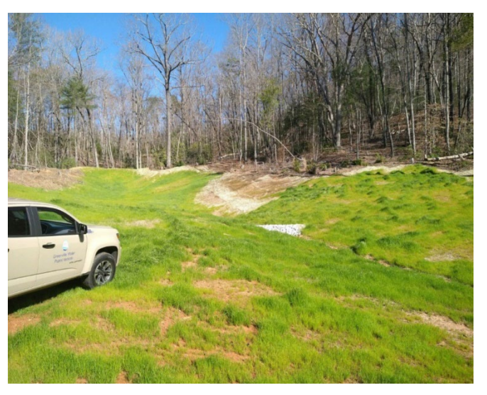
Boy scout property pre-work (left) and post-work (above)

In late 2022, DHEC awarded Greenville Water additional funding for the project. This funding was used to remove debris, stabilize ~800 feet of streambank through grading, and to replant the native riparian buffer at the old Dover nursery (a property recently purchased by Greenville Water).