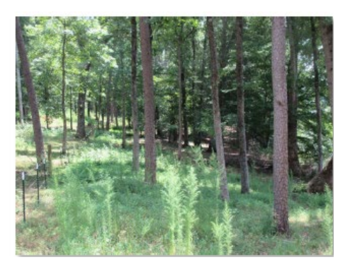
Livestock exclusion fencing and alternative water source