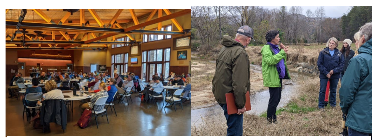
Streambank repair workshop in November 2022

Save Our Saluda, in coordination with Clemson Extension, conducted a Streambank Stabilization Workshop on November 10, 2022 with over 50 people in attendance. The workshop included speakers on topics including methods for repairing eroding streambanks, controlling exotic invasive species, and for establishing, enhancing, and maintaining riparian buffers to protect streambank property and downstream water quality. Partnering organizations shared information on local programs, available technical and financial assistance. Each participant received a packet of information that included fact sheets on riparian buffers, live stake harvesting and planting techniques, species lists for native floodplain and riparian herbaceous and woody species, regional plant vendors, stream restoration contacts, and Clemson Extension's Stream Bank Repair Manual for South Carolina. The afternoon included a field tour of a nearby stream restoration project and a live stake demonstration.