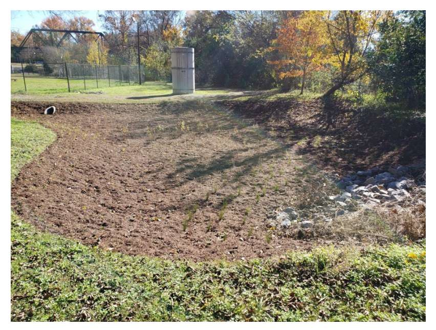
Earlewood Park bioretention area

The bioretention area functioned well, with planted turf grass remaining healthy and no sign of