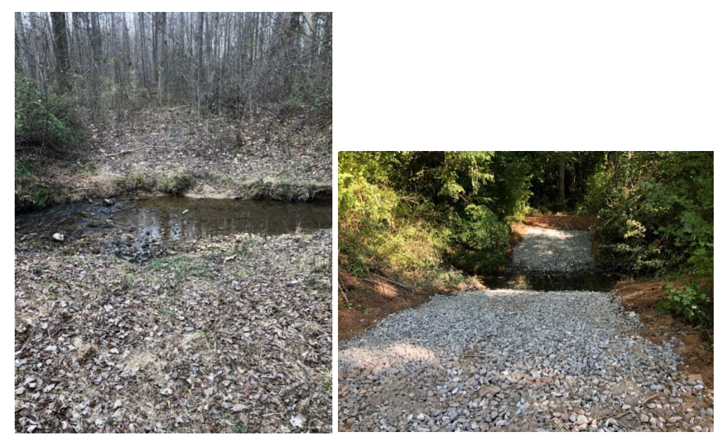
Before and after of a stream crossing installation

Sediment and bacterial pollution from eroding stream banks are another common contributing factor of biological and recreational water quality impairments in these watersheds. Upstate Forever worked with a landowner to install a stream crossing on their property, a tributary to the North Tyger River located in the northern section of the North Tyger River Watershed.