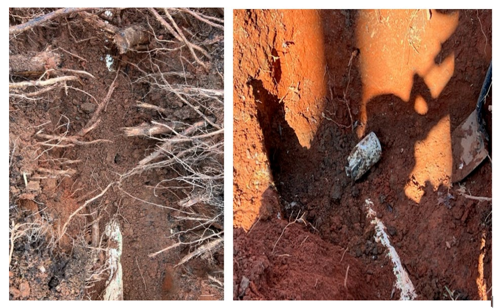
Drain line impacted by roots (left) and visible sludge (right) at elbow of pipe before repair

In August 2020, Lake Keowee Source Water Protection Team (LKSWPT) was awarded a two-year Section 319 grant to reduce bacterial pollution in the Cane Creek-Little River Watershed (030601010305), within the greater Keowee River Watershed (0306010103), through a Septic Find and Fix Program. The proposed project includes the repair and replacement of 32 septic systems to address bacterial and nutrient pollution in this watershed. Numerous stakeholders have assisted the LKSWPT by providing a combination of financial and in-kind support for this work. Project partners include: Friends of Lake Keowee Society (FOLKS), Duke Energy, Pickens County, Oconee County, Greenville Water, Advocates for Quality Development, Seneca Light and Water, Clemson Center for Watershed Excellence, Clemson Extension, and Upstate Forever.