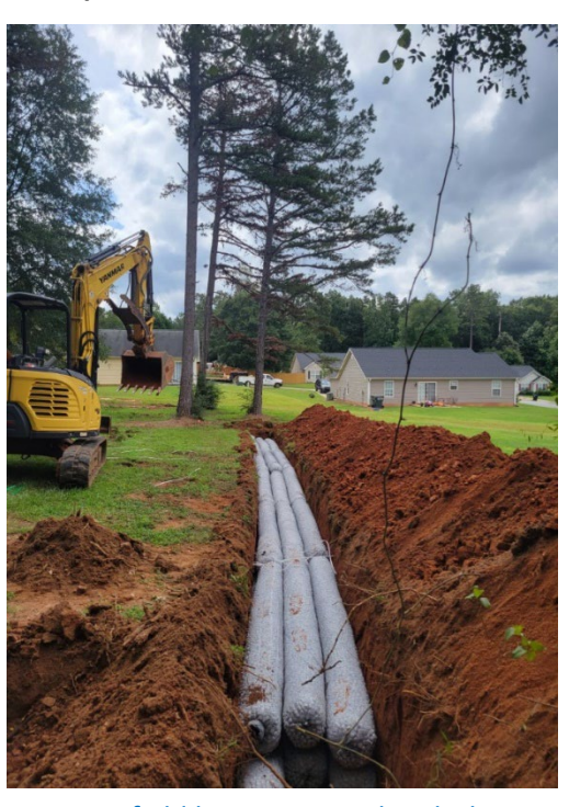
Drainfield being repaired with the installation of F7 Flow drainage lines

In 2020, Upstate Forever was awarded a three-year 319 grant to implement BMP recommendations from the Watershed Based Plan for the Three and Twenty Creek Watershed, to reduce bacteria, nutrient, and sediment pollution in the Three and Twenty Creek subwatershed. To date, Phase 1 has included the repair and replacement of 27 septic systems, 3 agricultural improvement projects, protection of 100 acres or more of priority lands, and a stream bank repair project/workshop. Numerous partners have assisted Upstate Forever along the way by providing a combination of financial and in-kind support for this work. Project partners include Anderson Regional Joint Water System (ARJWS), Anderson County, Anderson County Soil and Water Conservation District, City of Anderson Stormwater Department, Anderson & Pickens County Stormwater Partners (APCSP), Clemson Cooperative Extension, Pickens County Stormwater Department, and Lake Hartwell Association.