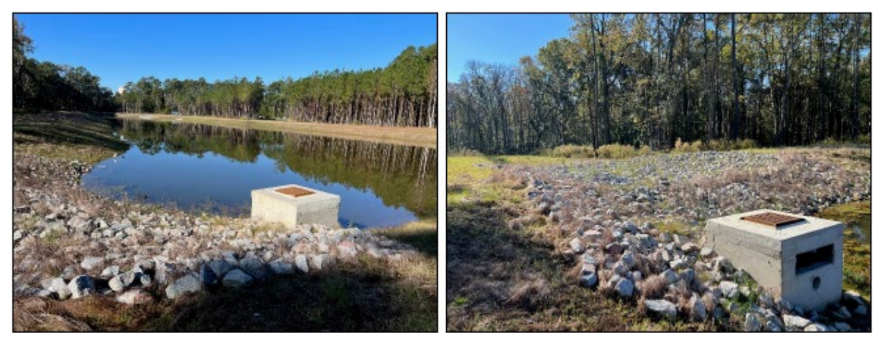
Constructed wet detention pond at the outfall structure

• Reduce the number of bacteria, specifically fecal coliform (FC), reaching SCDHEC Station 18-08.