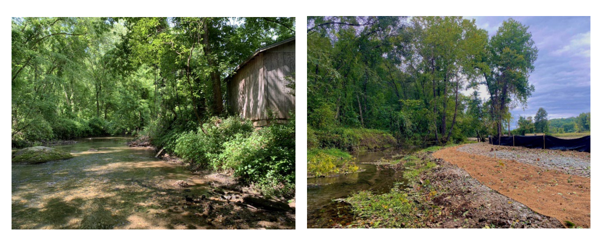
Dover property before photo (left) showing eroded bank and dilapidated building and after (right) hydroseeded and matted bank area

During Phase One, Greenville Water made numerous connections in the community. Partnering with landowners created significant opportunities for education. Many of the area's property owners attended a Greenville Water picnic to showcase the demonstration site and to learn more about the North Saluda River Headwaters Restoration project.