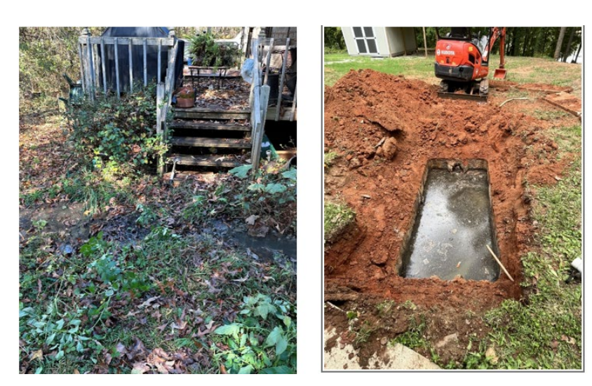
Images of failing drainage field (left) and surfacing wastewater (right) in the Three and Twenty Creek Watershed.

Sediment and bacterial pollution from eroding stream banks are another contributing factor of biological and recreation water quality impairments in this subwatershed. Upstate Forever is partnering with Clemson Extension to conduct a streambank repair workshop on Boscobel Golf Course in the spring of 2023. The workshop is set to be divided into two components: a classroom portion and a hands-on installation workshop. The classroom portion is planned to provide background