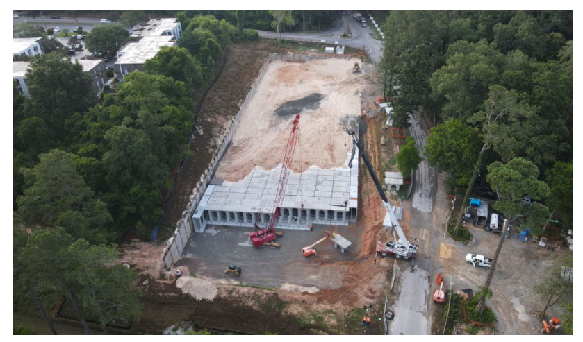
BMP6 Vault Installation

BMP 6A was installed first, then BMP6. The Stormwater interception lines for the railroad and South Boundary stormwater lines and the interconnection line between the two BMPs were completed next. Installation of the Opti control system was then