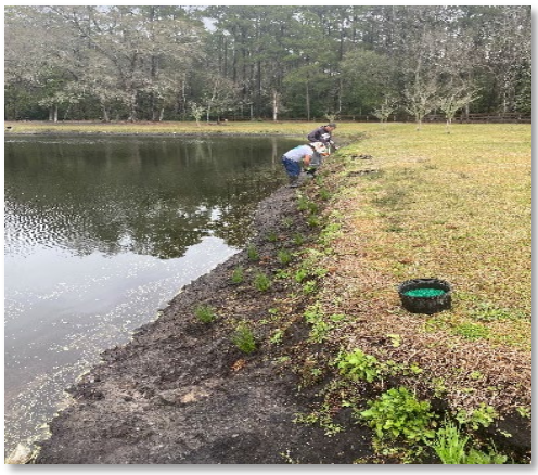
Riverside Park shoreline plantings

In 2022, Coastal Carolina University completed a second oyster restoration project along the shoreline of House Creek, adjacent to the Future Farmers of America property located off of Little River Neck Rd. The restoration project occurred on April 27-28, 2022 and involved numerous volunteers. This project served as a second phase of the project that completed in 2022, expanding on the size of the previous installation.