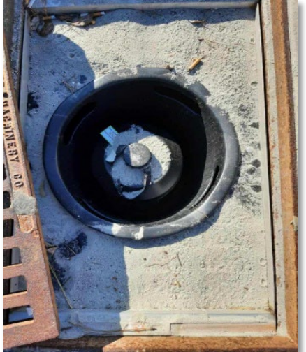
Filtrexx Stormwater Catchment Basiı Filter on Ocean Blvd

Additionally, in partnership with Horry Soil and Water Conservation District, three septic tank upgrades were completed in the Little River Neck area on Jacks Circle, in addition to a sewer tie-in on Riverside Drive. North Myrtle Beach has recently secured federal funding to install sewer lines in existing gap areas off Little River Neck Rd, which will have a significant impact on water quality, as there will be more future opportunities to tie properties into a municipal sewer system, as opposed to septic repair or replacement.