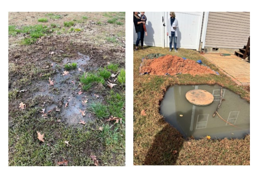
Images of a failing septic drainage field (left) and surfacing wastewater (right) in the South Tyger River Watershed

Upstate Forever has successfully recruiting landowners to participate in this project even with the obstacles presented by the COVID-19 pandemic. Upstate Forever participated in several inperson events throughout the year since transmission rates of COVID-19 have steadied out. Outreach events have included our participation in Discover Your Watershed in May, Imagine a Day Without Water in October, and Lake Robinson Day in November. Our team has continued social media posts and other publications including our