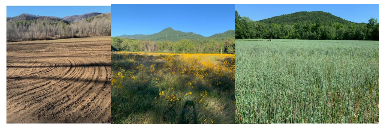
Before and after photos of restoration of a floodplain of Middle Saluda River

The goal of Save Our Saluda's implementation project is to install agricultural Best Management Practices (BMPs) to reduce sediment pollution, protect water quality, and improve the health of aquatic communities in the Upper Saluda River Watershed. During 2022, a total of 48 acres were planted in cover crops at 5 sites. Ten acres were seeded to create native meadows and a half acre wetland area was planted with native trees, shrubs, and herbaceous plants to restore floodplain and riparian areas at a site along the Middle Saluda River. An organic multi-species cover crop seed mixture was planted on 5 acres of crop fields along the floodplain of the North Saluda River. Fall cover crops were planted across 33 acres at 3 additional farms in floodplains next to Terry Creek and the North Saluda River.