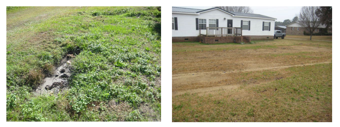
Failing drainfield before and after construction

The DHEC sponsored 319 Water Quality Improvement Grants have provided the matching funds to enable the Horry Soil and Water Conservation District to cost share with homeowners to make needed repairs to their failing septic systems or tie on to sewer in areas where it is available. The Water Quality in Horry County is better than it would have been without these needed repairs. This partnership with DHEC has improved the quality of life in Horry County.