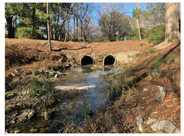
Culverts to be daylighted in the upcoming work

stable stream alignment through a portion of Timrod Park. The two projects will be designed and permitted concurrently but constructed under separate construction contracts. Construction will be completed for Cedar-McQueen prior to construction of the Project to reduce potential for sedimentation and disturbance along the Project area. Currently, it is anticipated that construction for Cedar-McQueen will occur in late 2023, with construction of the Project completed in early 2024. This represents a slight delay in the initial grant schedule, but falls within the timeline of the granting period. Progress updates will be provided to SCDHEC as design of both projects reach critical