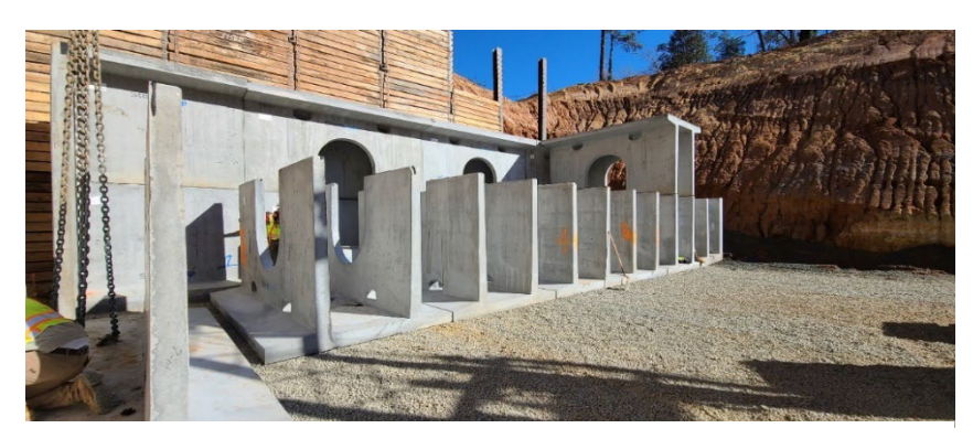
BMP6A initial vault sections installation

pollutants, turbidity, litter, and fecal coliform found in urban runoff. This will benefit the existing TMDL for pathogens in this watershed. Stormwater volume reduction will be achieved through construction of an underground stormwater detention system that will intercept stormwater from the main stormdrain outfall and infiltrate stormwater prior to entering the Sand River.