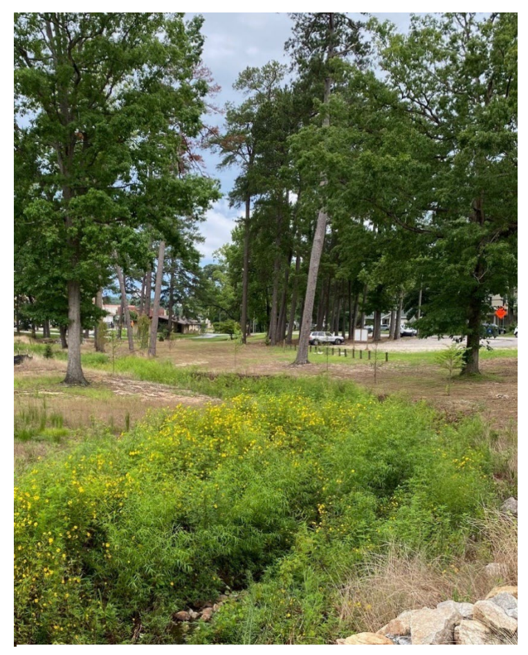
Completed stream daylighting in Hyatt Park

The stream daylighting component, which uncovered approximately 1,150 lf of a piped unnamed Smith Branch tributary runs through the center of Hyatt Park. The Smith Branch tributary is a USGS Blue Line Stream that is listed by the South Carolina